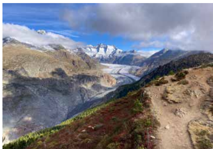
Figure 1: The Aletsch Glacier, the largest glacier in the Alps, as viewed from the Riederfurka.