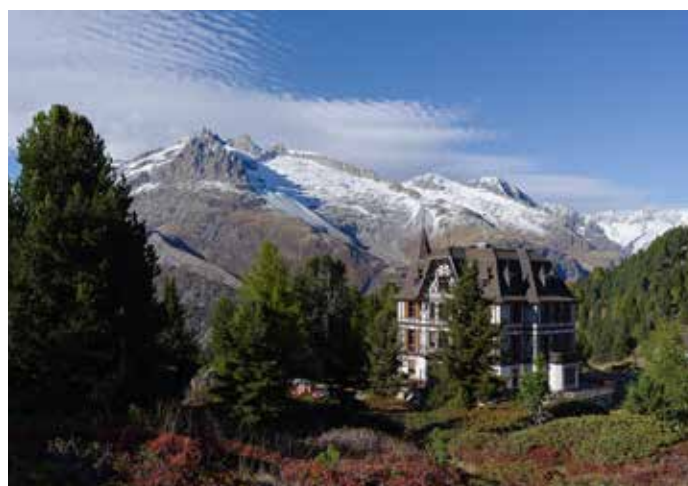
Figure 4: The Villa Cassel, built at the turn of the 20th century for English nobleman Ernest Cassel on the Riederfurka in the Valais Alps.