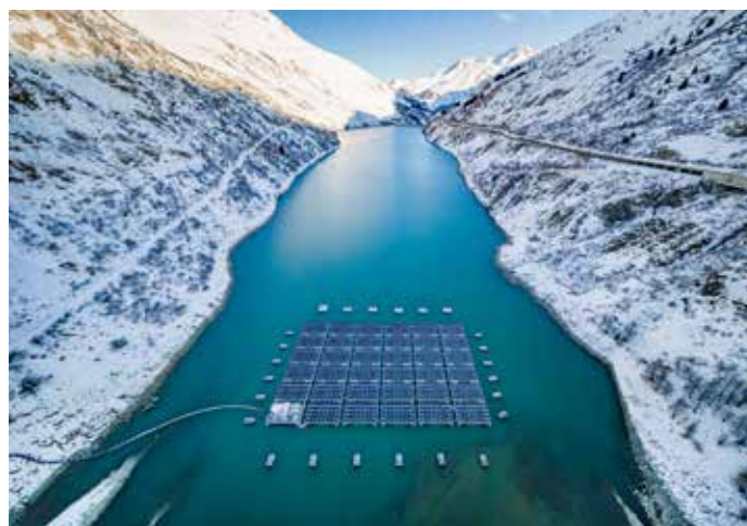
Figure 3: The world's first high-altitude floating solar farm, in the canton of Valais.