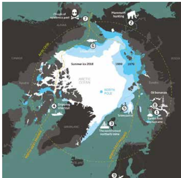
Figure 2: The melting of Arctic ice will result in a race for control over transportation routes and precious minerals with far-reaching geopolitical impacts.